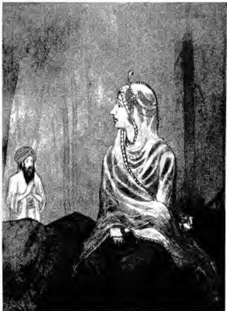
"Art thou some angel, Peri , goddess, or spirit?"